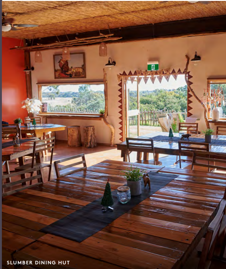
SLUMBER DINING HUT